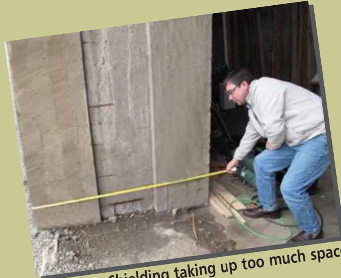
Radiation Shielding taking up too much space