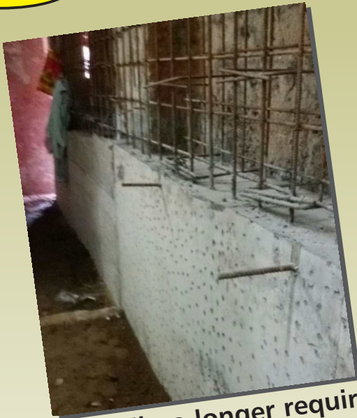
Thick wall no longer required for Radiation Shielding