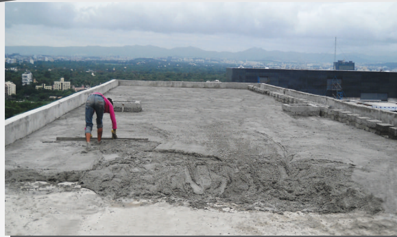
Elitecrete™ being laid on a terrace slab.